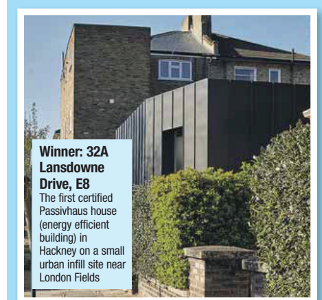
Winner: 32A Lansdowne Drive, E8 The first certified Passivhaus house (energy efficient building) in Hackney on a small urban infill site near London Fields