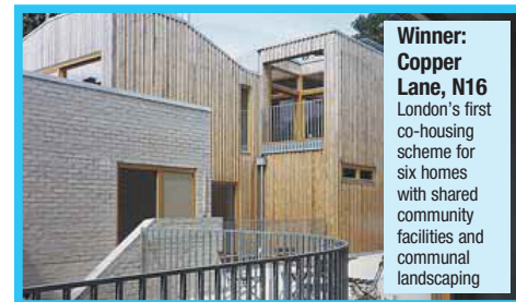
Winner: Copper Lane, N16 London's first co-housing scheme for six homes with shared community facilities and communal landscaping