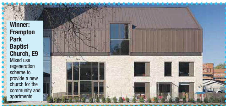
Winner: Frampton Park Baptist Church, E9 Mixed use regeneration scheme to provide a new church for the community and apartments

For more info, visit: www.hackney.gov.uk/designawards