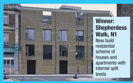
Winner: Shepherdess Walk, N1 New build residential scheme of houses and apartments with internal split levels