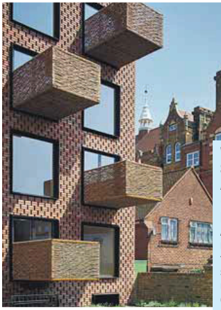
Winner: Spruce Apartments (Nordic Lofts), N16 An innovative new build timber housing scheme which uses materials creatively to provide six flats