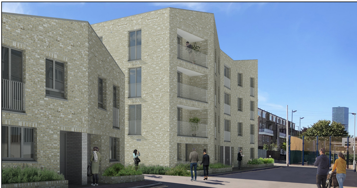
Computer generated image of Bramall Close by Newground Architects

We are pleased to issue the second newsletter for the construction works at Bramall Close and Idmiston Road. The development consists of 16 new homes at Bramall Close and eight new homes at Idmiston Road, as part of Newham Council's Affordable Homes for Newham programme.