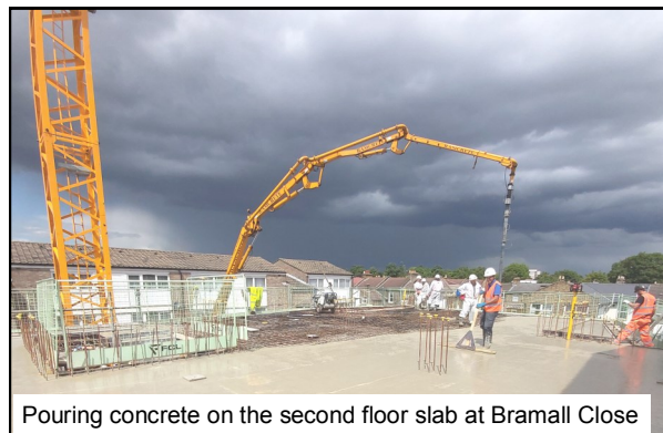
Pouring concrete on the second floor slab at Bramall Close