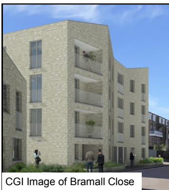
CGI Image of Bramall Close

If you would like project updates please email enquiries@rooff.co.uk . Progress photos of the project and a copy of the latest newsletter can be found on our website www.rooff.co.uk on the current projects page. If you would like this information communicated by an alternative method please email enquiries@rooff.co.uk .