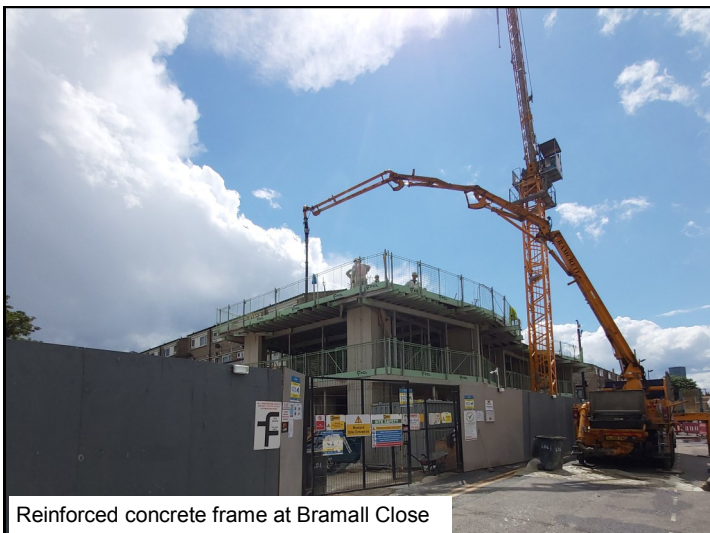
Reinforced concrete frame at Bramall Close

Over the last four weeks we have completed the screeding and fitted the internal doors. Upcoming works for the month of June include closing up the ceilings and plastering. We will also be continuing with the brickwork. The roof works will be finished.