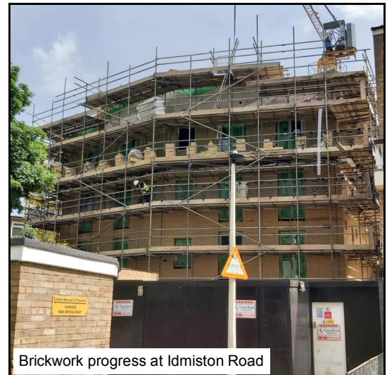
Brickwork progress at Idmiston Road