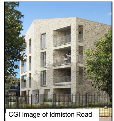
CGI Image of Idmiston Road